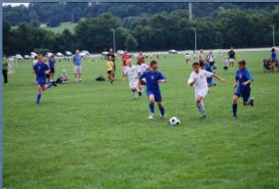
Boys U11 teams from 2 of the 14 participating clubs playing soccer