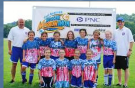
Team Photos in front of Sponsor Banner